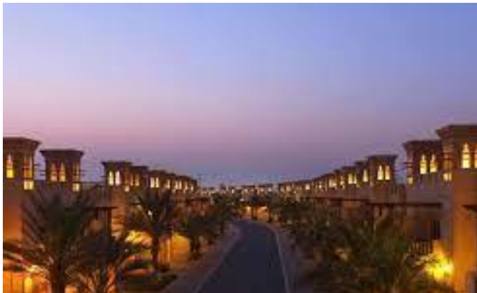
Mall & Entertainment