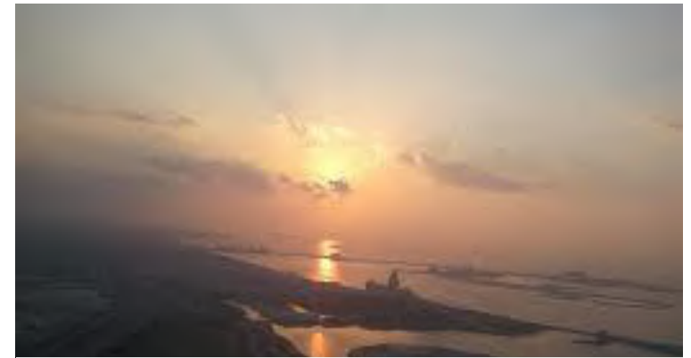
Amazing beach & sea