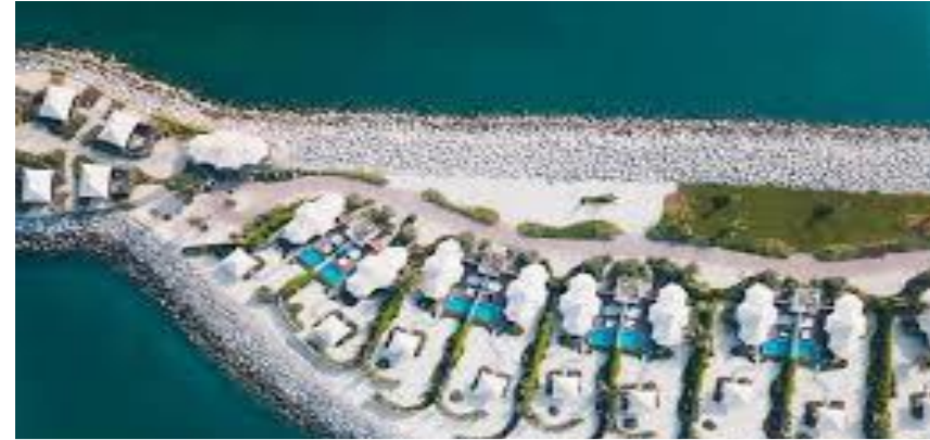
45 min Proximity to Dubai