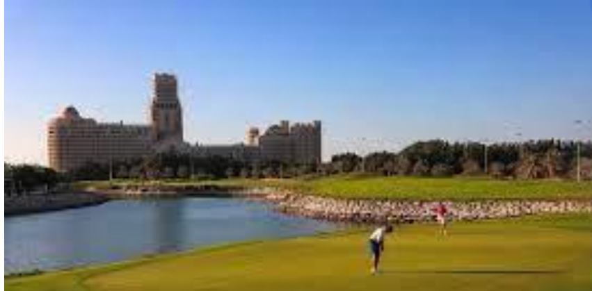
Great weather (-3% vs rest of UAE)